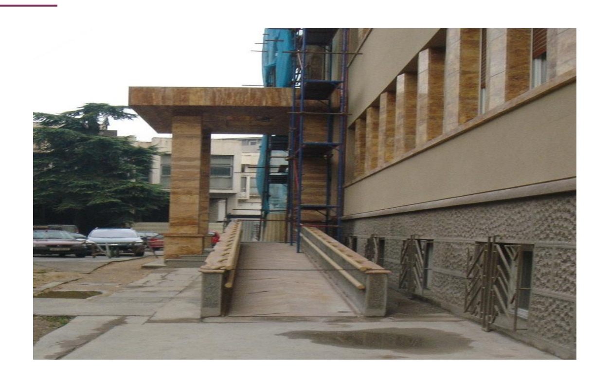
Assembly of R. Macedonia