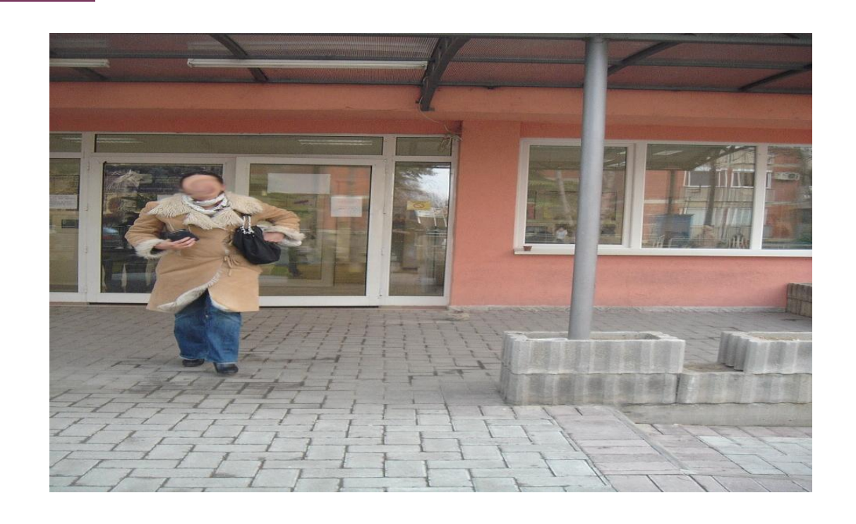
Employment Service Agency of the R. Macedonia