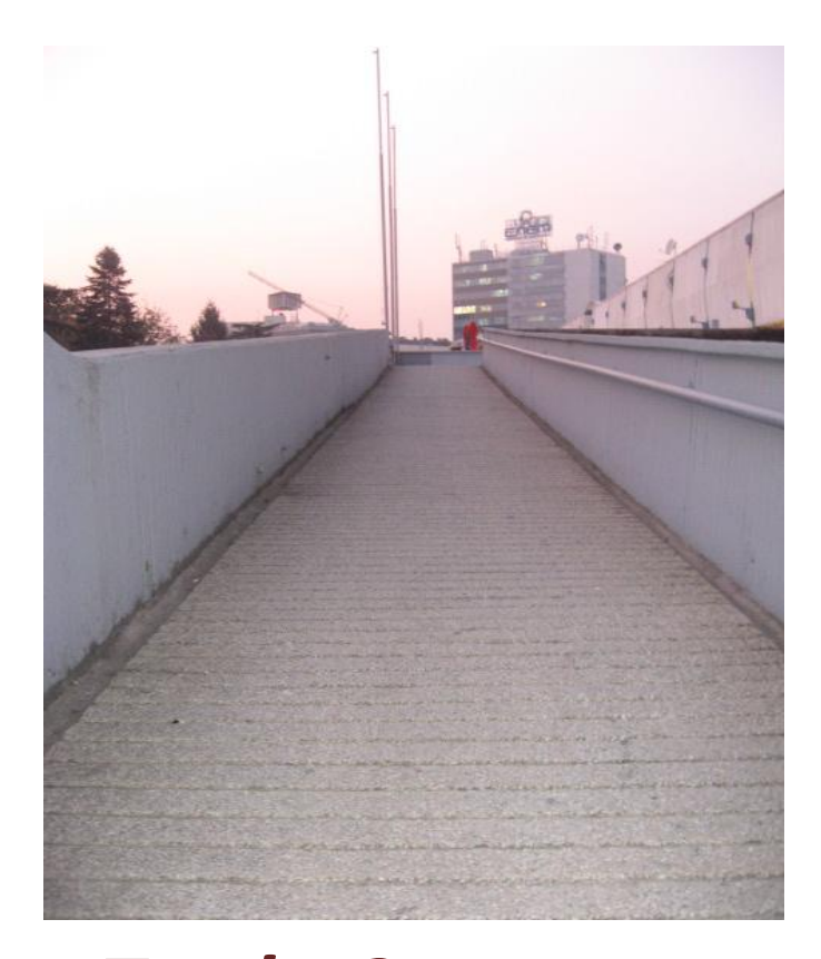
Ramp at the City Trade Center